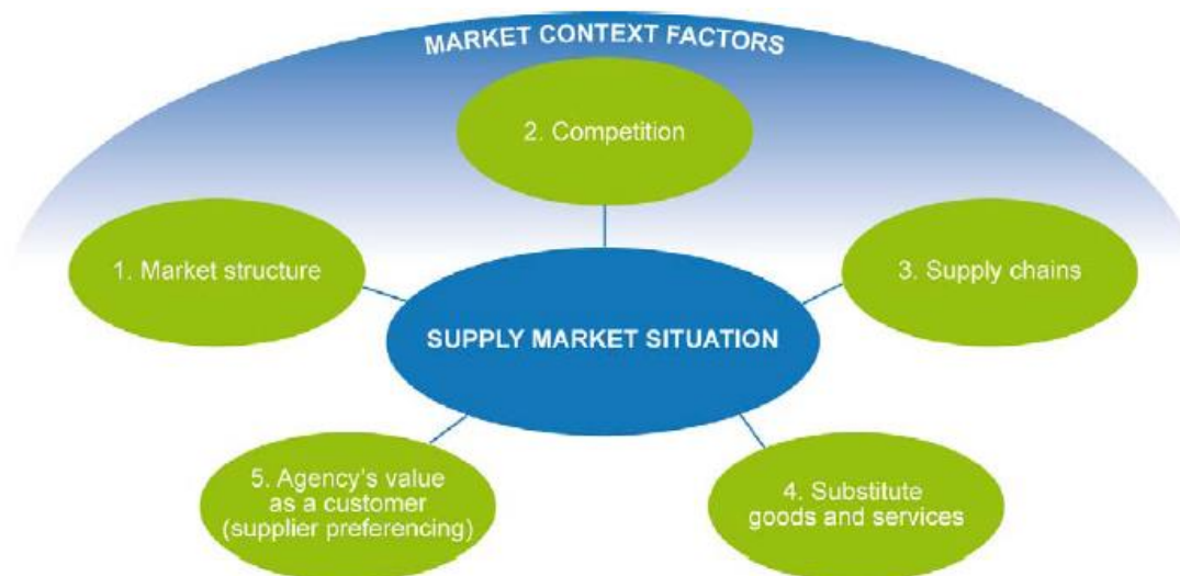
Figure 1: The supply market analysis framework

In addition, economic, socio-cultural, technological, environmental, sustainability and legal factors should be analysed. This will assist in identifying supply-related risks and opportunities.